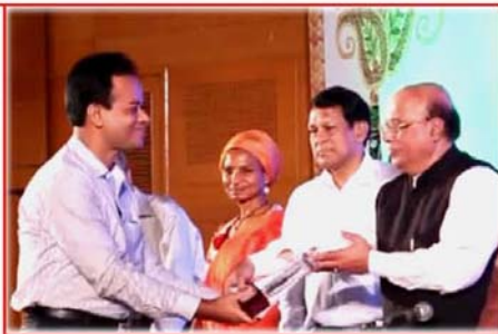
Project Director of SGS receiving National Award from Honorable Health Minister Md. Nasim, GOB